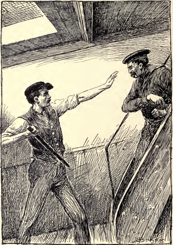
MULGRUM AND THE ENGINEER.